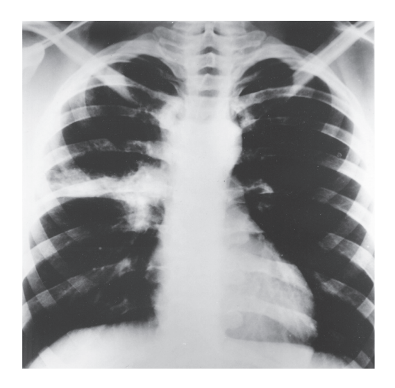
Figure 1 Infiltrate of the upper right lobe and hilar lymph node enlargement Slika 1 Infiltracija gornjeg desnog režnja i uvećanje hilarnog limfnog čvora

At the age of 15 the boy had lasting fever and chronic cough again. Complete blood count showed to be normal except decreased platelet count of 40000/mm<sup>3</sup>. Lungs radiography showed infiltrate of the upper right lobe and hilar lymph node enlargement (Figure1).