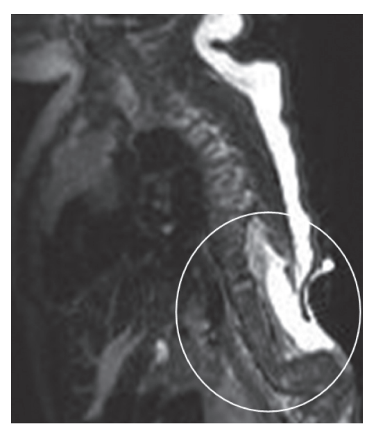
Figure 2 The sagital unenhanced T1-weighted image of the spine shows thoracolumbar spina bifida cystica with the sac filled with cerebrospinal fluid and neural placode of the "normal" hemicord which correspond to hemimyelomeningocele.