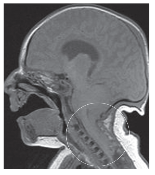
Figure 1 The sagital unenhanced T1-weighted image of the brain shows a small posterior fossa with caudal displacement of the fourth ventricle, medulla oblongata, vermis and the cerebellar tonsils through an enlarged foramen occipitale magnum into the spinal canal at the level of the 1st thoracic vertebra.

Multiple anomalies were observed in a fullterm male newborn from the second, regularly controlled pregnancy, immediately after birth, as follows: facial dysmorphia, pes equinovarus and cystic lesions in the thoracolumbar spine segment which suggested myelomeningocele. In neurological status, the newborn was hypertonic with evident crossing of the lower extremities. Cranial ultrasound revealed hydrocephalus while magnetic resonance of the brain revealed a small posterior fossa with caudal displacement of the fourth ventricle, medulla oblongata, vermis and the cerebellar tonsils through an enlarged foramen occipitale magnum into the spinal canal at the level of the 1st thoracic vertebra, with consequent supratentorial hydrocephalus, indicating Arnold Chiari II malformation (Figure 1). MR imaging of the thoracolumbar spine segment revealed multiple anomalies of the spine and the spinal cord in the form of open spinal dysraphism: the split of the thoracolumbar segment of the spinal cord into two hemicords (diastematomyelia) with syringohydromyelia of the left hemicord; thoracolumbar spina bifida cystica with the sac filled with cerebrospinal fluid, neural placode of the "normal" hemicord and second hemicord with syringohydromyelia which corresponded to hemimyelomeningocele (Figure 2). The lumbar