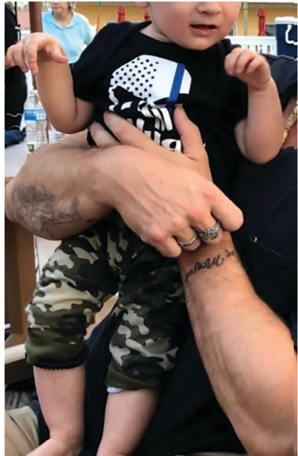
Fig. 1. The Patient Is Unable to Utilize the Large Muscle System to Raise Himself to a Standing Position.

SNP microarray analysis was performed using the Affymetrix Cytoscan HD platform (LabCorp) applying methodology provided by the manufacturer. 250 ng of total extracted genomic deoxyribonucleic acid (DNA) was digested with NspI and after ligation to NspI adaptors was amplified using Titanium Taq with a GeneAmp polymerase chain reaction (PCR) System 9700. PCR products were purified, DNA was fragmented, biotin labeled and hybridized using Chromosome Analysis Suite. The analysis was based on the GRCh37/hg19 assembly. Truly balanced chromosome alterations will