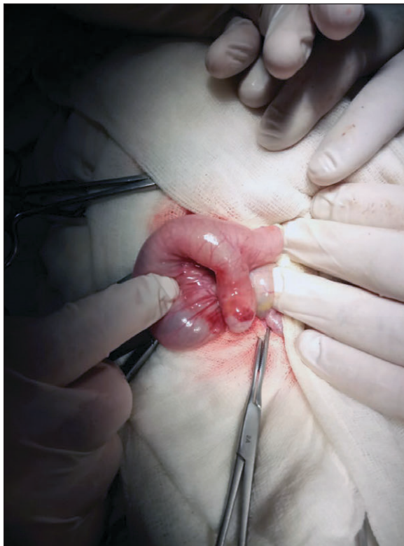
Fig. 2. Hemorrhaging Meckel's Diverticulum.

a preliminary diagnosis of Meckel's diverticulum bleeding was established. Considering the patient age, condition, and emergent prognosis, the decision was made to establish interventional care and proceed with surgical correction as follows: access to the peritoneal cavity was made via laparoscopic