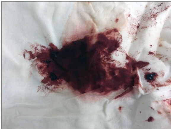
Fig. 1. The Appearance of Hemorrhage on Patient's Diaper the 14 Hours after the Enema Procedure.