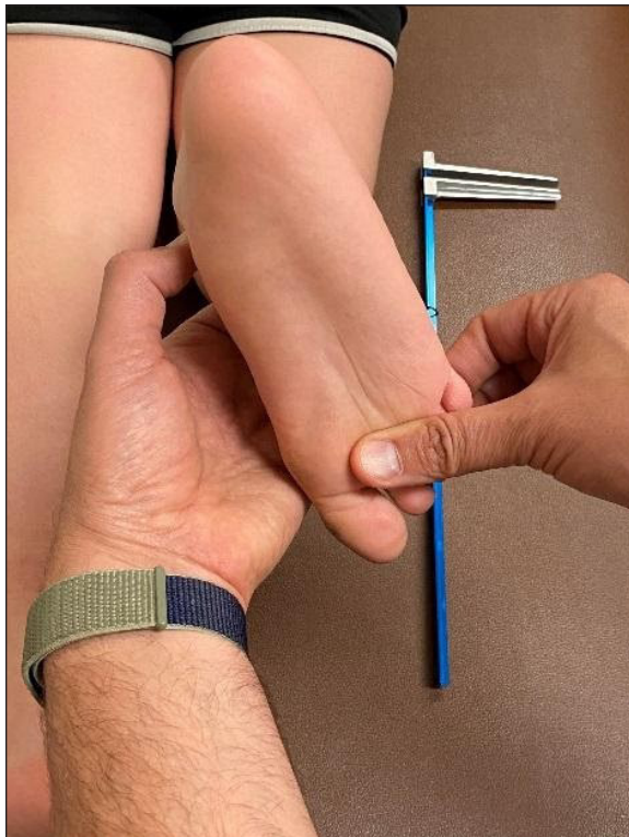
Fig. 1a. Foot thigh angle measured in simulated weight-bearing position, approximately 45 degrees external rotation.

Fig. 1a demonstrates a child with CP spastic diplegia, measuring tibial torsion using TFA while the foot is in a simulated weight-bearing position. External rotation of approximately 45° is measured. This may lead to the conclusion that tibial torsion is the source of the rotational deformity (Fig. 1a). However, measuring TFA in STN in Fig. 1b reveals a much lesser degree of external rotation (0°) (Fig. 1b). This emphasizes the role of the foot in the external rotation profile and one can assume that in weight-bearing (Fig. 2), the source of the rotation is within the foot.