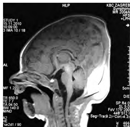
Fig 1. MRI of the Skull: Occipital Bone Fracture with Epidural and Subdural Haematoma.

During the first year of follow-up the diverticulum did not empty properly and the boy suffered numerous UTIs, despite prophylactic antibiotics. At the age of 3 years we started clean intermittent catheterisation, and this was helpful for 2 years. However, at the age of 5 years the urinary infections started occurring once again and a new diverticu-