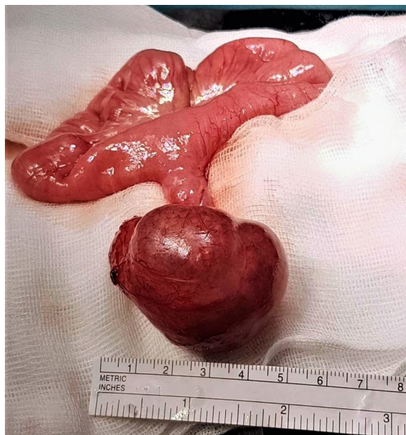
Fig. 2. Intraoperative findings showing twisted giant cystic Meckel's diverticulum.